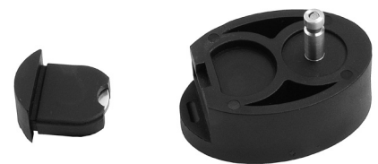
dV-1 in oval housing with battery compartment and pressure connection nipple, ø 5 mm