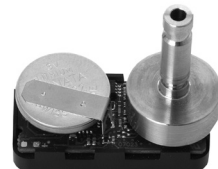
dV-1 OEM module with soldered-in battery and pressure sensor connection, ø 5 mm