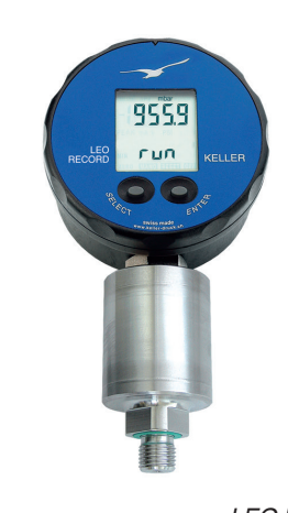
LEO Record Ei with capacitive sensor